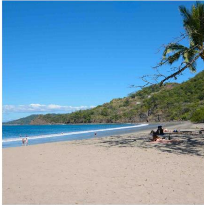
2 min. walk to beach