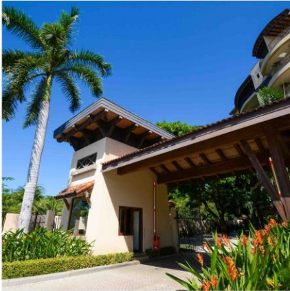
24/7 Gated Security