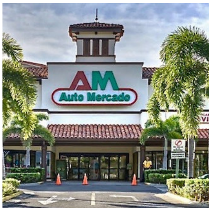
Supermarket & Retail Shops