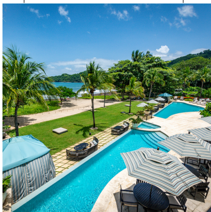
2 pools & private Cabanas