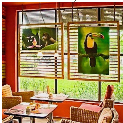
Coffee shop & Restaurants