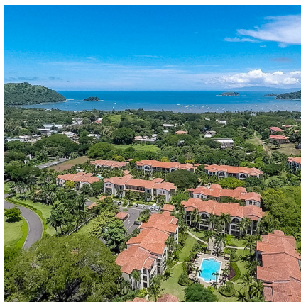
Walk to the beach!