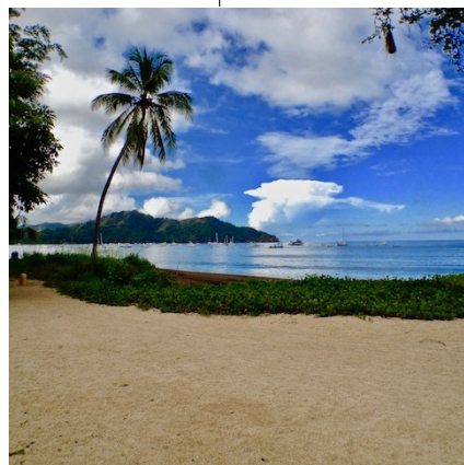
Free shuttle from Development