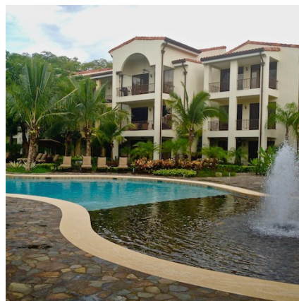
4 Community Pools