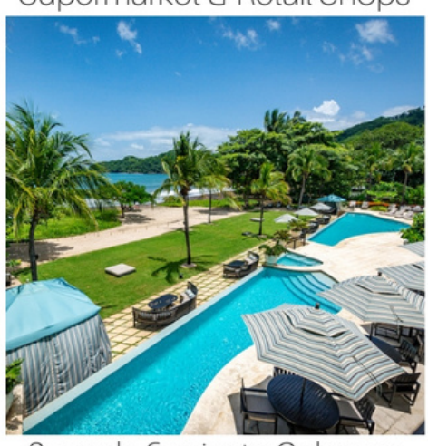
2 pools & private Cabanas