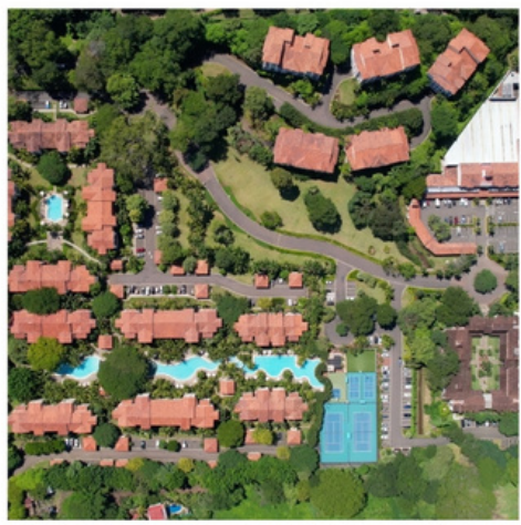
4 Pools & Sports Complex