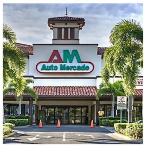
Supermarket & Retail Shops