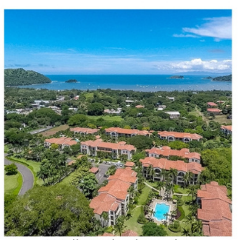
Walk to the beach!