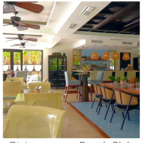
Dining room at Beach Club