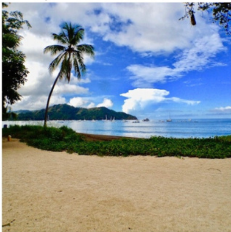
Free shuttle to Beach Club